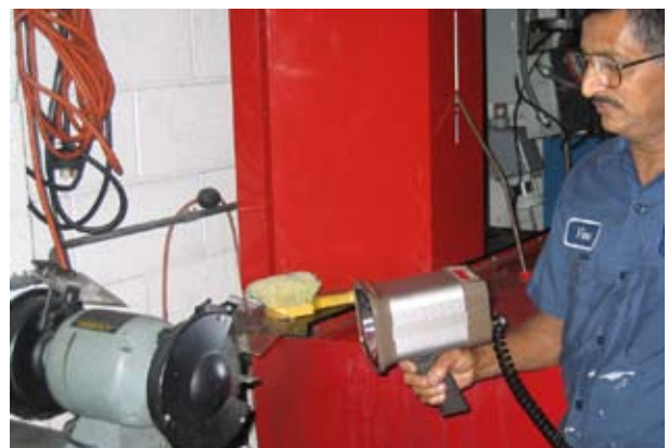
DT-315AEB Viewing Machinery